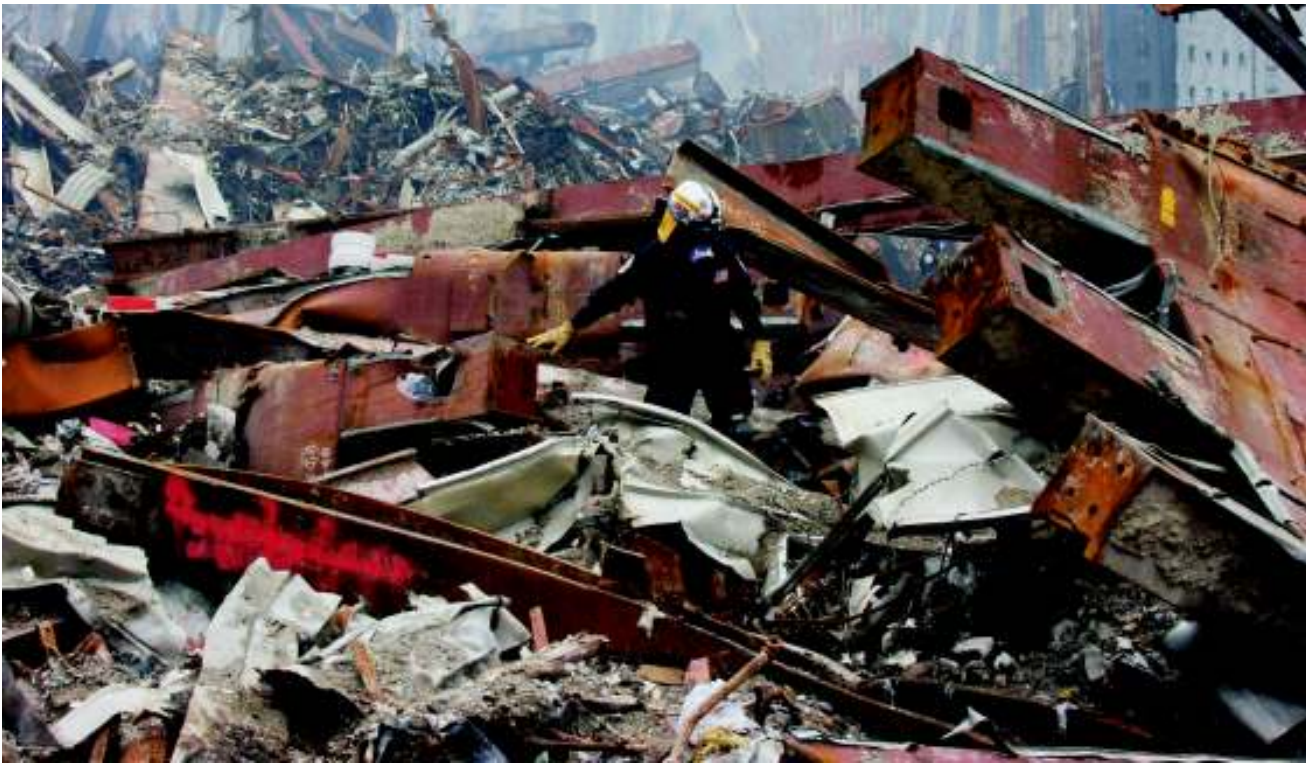
The towers look as if they were put through a giant shredding machine.