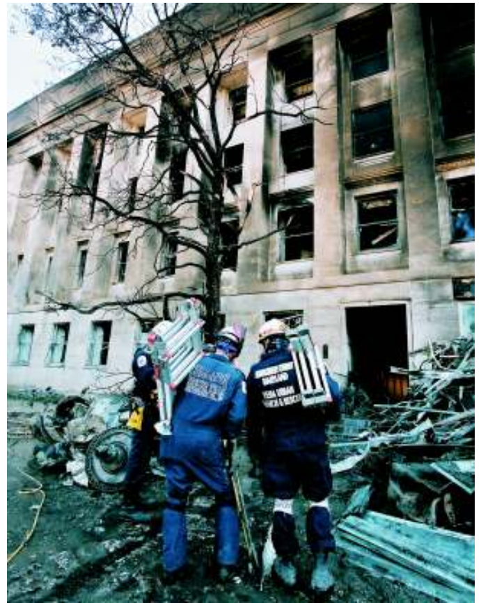
Figure 1-3 Only one piece of engine was found at the Pentagon

The wings are made of carbon fiber. If the carbon fiber burned, that would explain the lack of airplane debris